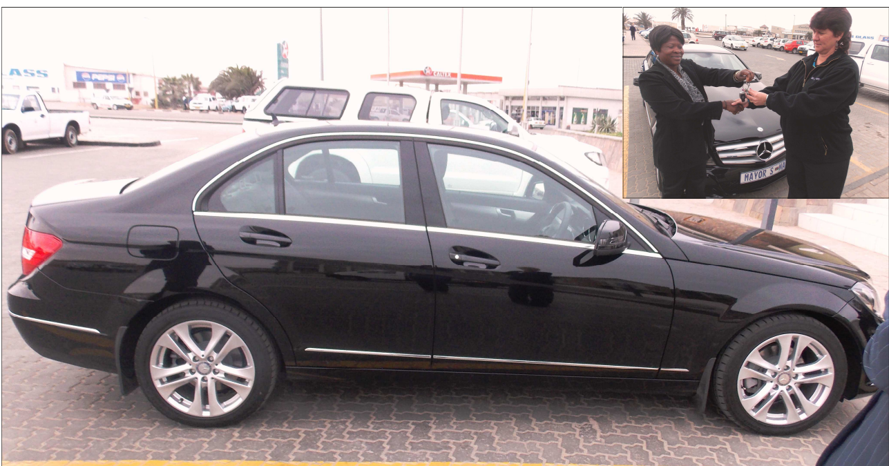
The official vehicle of the Mayor of Swakopmund. It's a black Mercedes Benz C200 with a personalized number plate. (Insert) The Mayor receiving the car keys from the dealer.