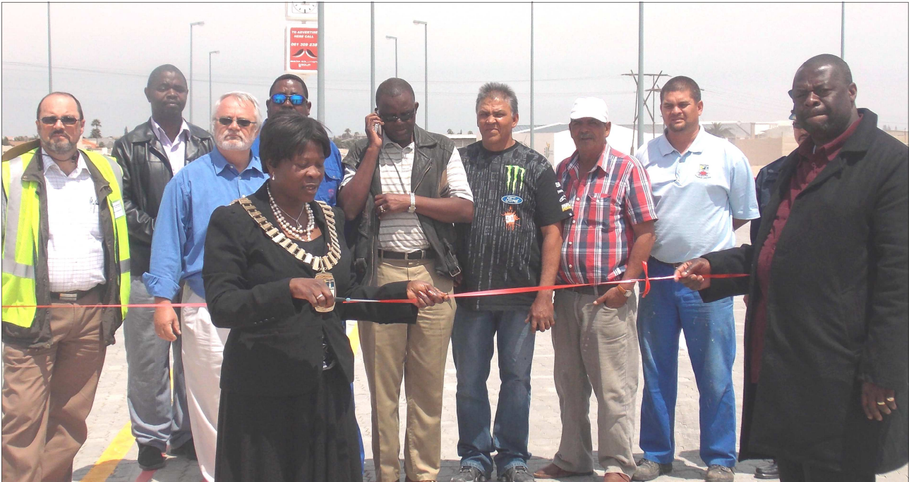
The Mayor of Swakopmund, Alderwoman Rosina //Hoabes (centre) pictured with the Chairperson of the Management Committee, Councillor Nehemiah Ndara Salomon and Municipal staff members and contractors during the opening of the Traffic Circle on the B2 main road.

The traffic circle at the entrance of town on the B2 main road was recently opened by Her Worship the Mayor, Alderwoman Rosina //Hoabes. Vehicular traffic has increased considerably over the last decade and that requires the implementation of different road transportation approaches.