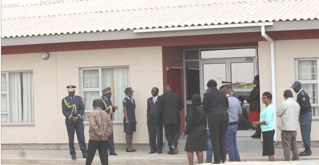
Police Barracks donated to the Namibian Police by Council

The Swakopmund Municipal Council has achieved yet another milestone by donating flats to the Namibian Police. The donation of a 2 026 m 2 blocks of flats to the Namibian Police demonstrates Council's commitment towards a safe and crime free society.