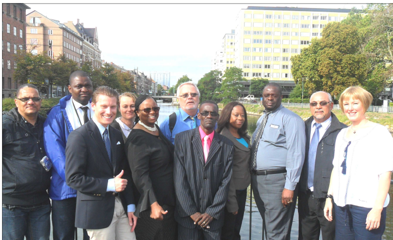
Council's delegation which visited Malmö in Sweden pictured with the hosts.

The relationship between the city of Malmö in Sweden and the Swakopmund Municipality continues to grow from strength to strength since its inception in 2008. Various projects mainly with the focus on sustainable development and the preservation of the environment are dealt with.